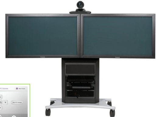
TANDBERG Integrated Video Unit

GET THE BEST FOR YOUR BUSINESS. Do more with TELUS solutions – connect with us today and we'll show you how. Contact your TELUS Account Executive, call 1-800-652-3266 or visit telus.com/conferencing .