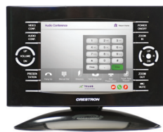
Touch Panel Control Systems