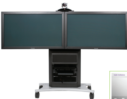
Polycom Integrated Video Unit