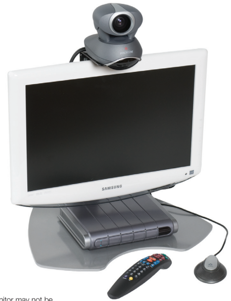
Monitor may not be exactly as shown