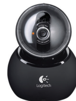
Camera may not be exactly as shown

CONNECT WITH US TODAY FOR HEALTHCARE SOLUTIONS Contact your TELUS Account Executive or call 1-800-652-3266 telus.com